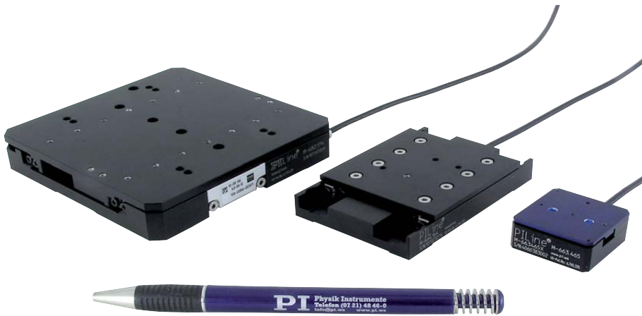
PILine® Micropositioning stages: M-682, M-664 and M-663 (from left)