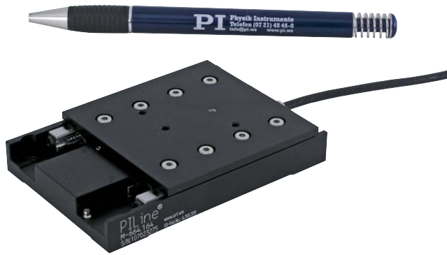
Fast and compact M-664 piezo translation stage with linear encoder