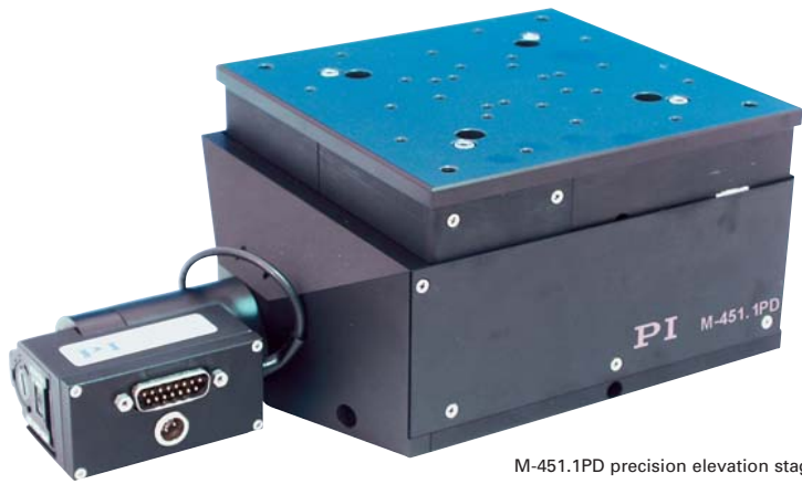
M-451.1PD precision elevation stage